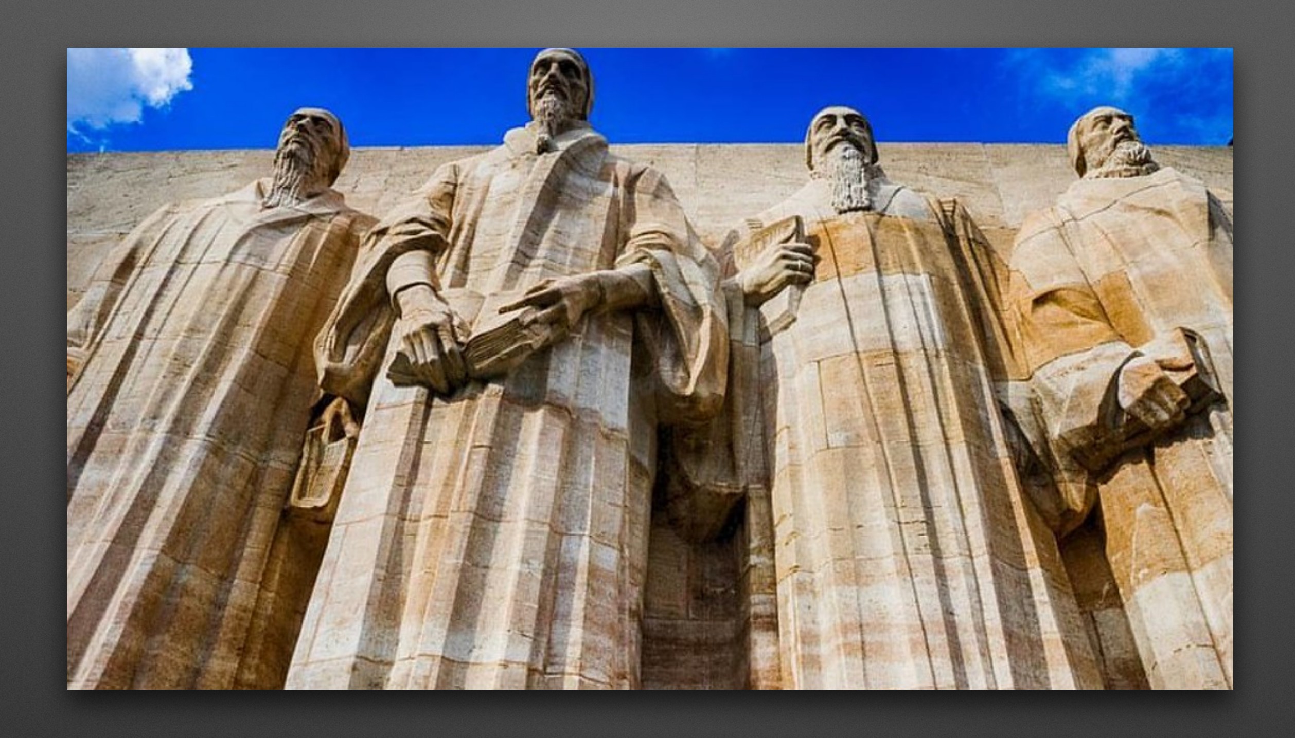
Lesson 10: The Church Responds to Reformation