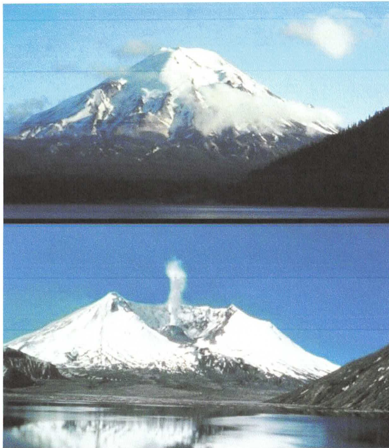
Mount St. Helen's before and after the eruption.