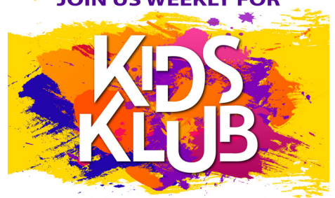
KINDER - 5TH GRADE / TUESDAYS 6-8 PM