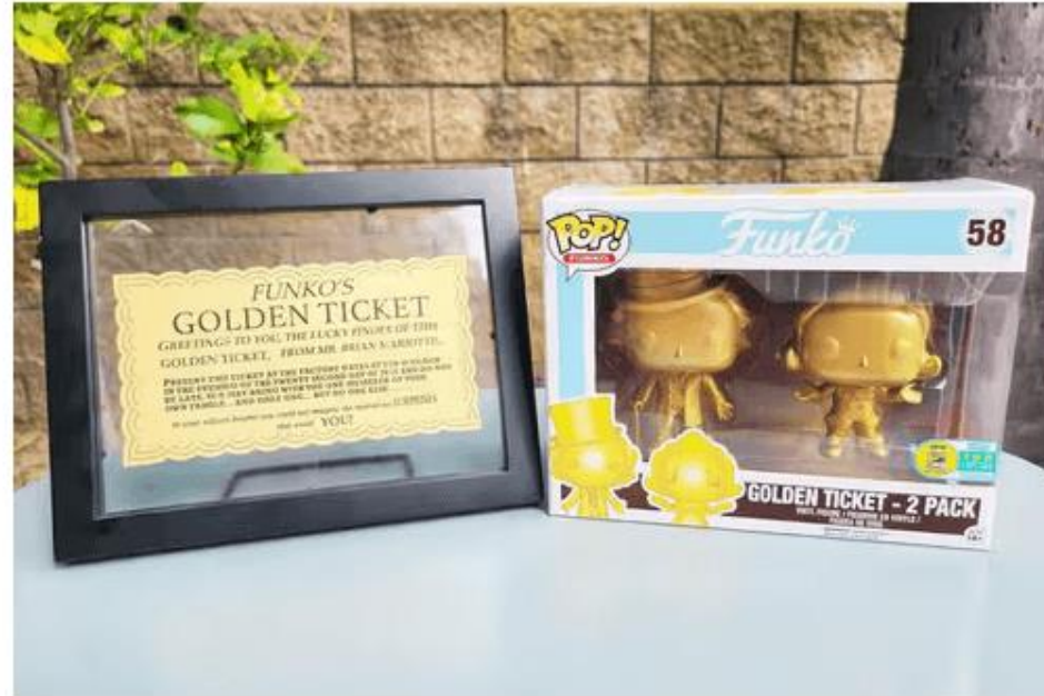
The 2016 Golden Ticket 2-Pack Willy Wonka and Oompa Loompa Funko Pops