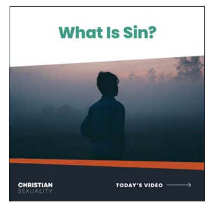
TODAY'S VIDEO: youtu.be/sbZSTsJVWkA

Reflect on Romans 2:4. Do you embody the kindness of Jesus to others? Is there someone in your life who you can show Jesus' love and kindness to this week?