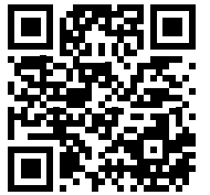
online Connection Card

Please use the Connection Card for any questions, comments, or prayer requests you may have and place in the basket on your way out of the Sanctuary today. You can also fill one out using our First UMC app or online at fumcgnv.org/ConnectionCard