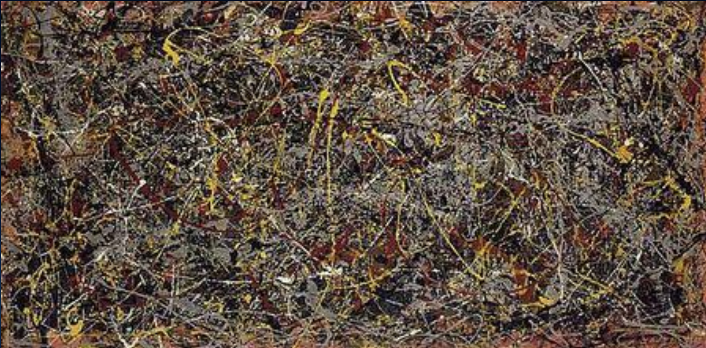
No. 5, 1948, by Jackson Pollack